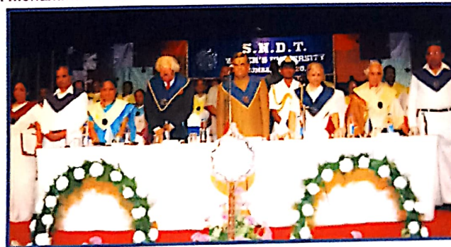
Annual Convocation 2004 - 2005, Presided over by Shri. S. M. Krishna, Governor of Maharashtra