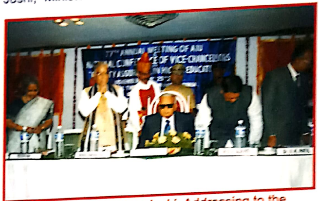
Shri. Murali Manohar Joshi, Addressing to the delegates.