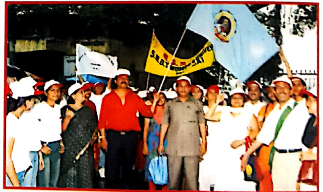
Shri. Ramesh Bhatkar, well known Marathi Actor Flagging off the AIDS Rally