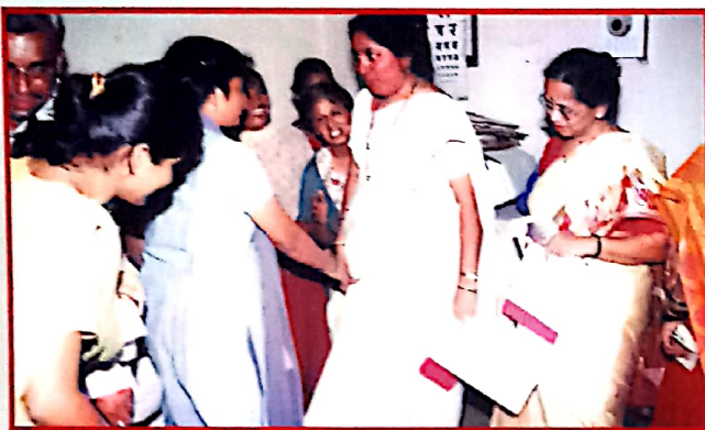
Physical Check up