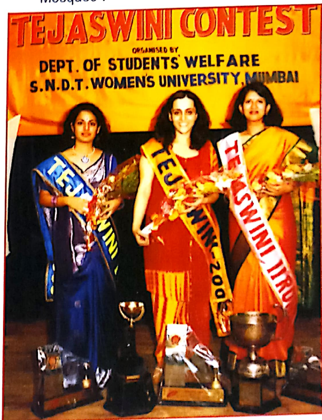
Winners of Tejaswini Contest 2005-06 Organised by : Department of Student's Welfare, S.N.D.T. Women's University, 12th to 18th January, 2006.