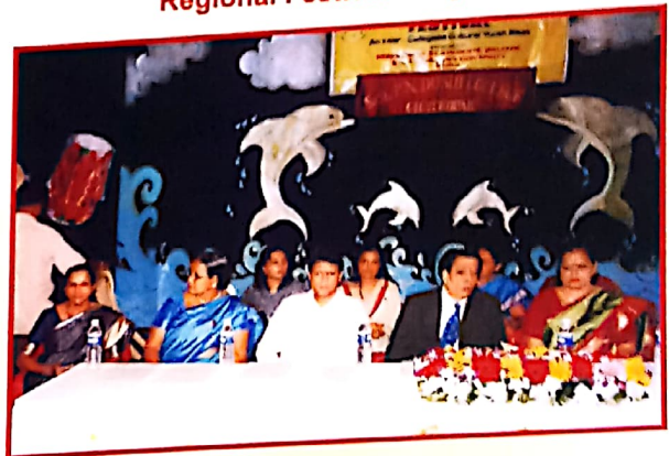
Regional Festival - Mumbai