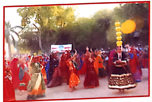
Students at Cultural Procession during the Inaugural Function, of SAUFEST 2007.

Over 250 Youth Delegates and Officials participated in the IInd SAUFEST held from March 7th to 11th, 2007. In addition to the 100 Foreign Delegates, 150 selected participants of the four Inter University Zonal Youth Festival, included