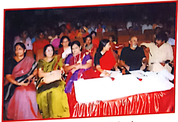
Regional Festival - Gujarat