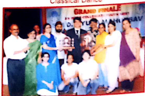
Champions - UMIT