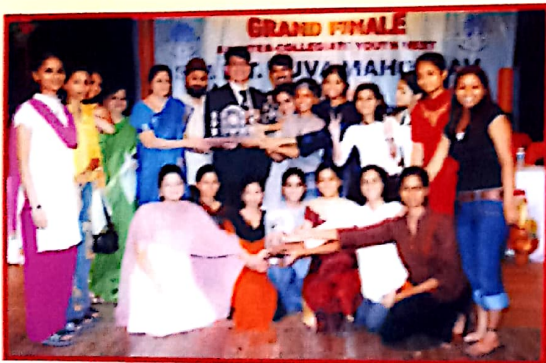
Runner up - SNDT Arts & Com. College Pune