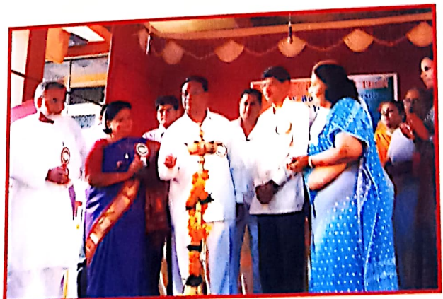
Regional Festival - Dhule