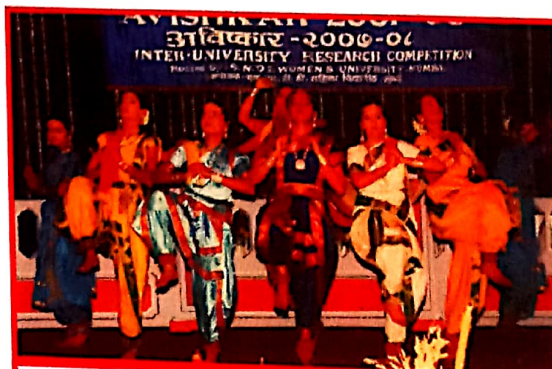
Students of PGSR performing folk dance of Maharashtra at cultural programme at Avishkar on 10-1-2008.