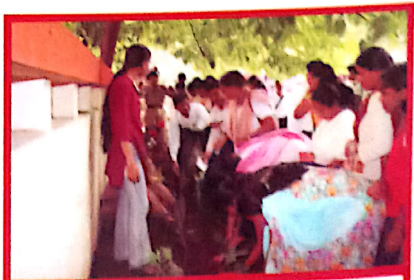
Students at Churchgate Campus