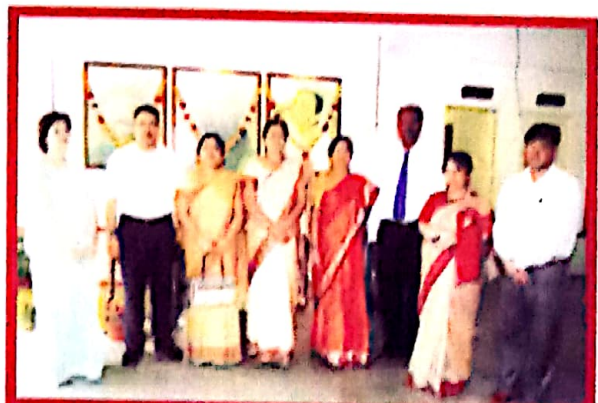
Hon'ble Vice Chancellor and Registrar with the UGC team