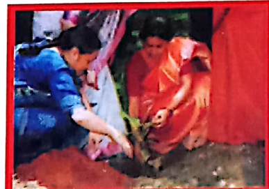
Faculty at Pune Campus