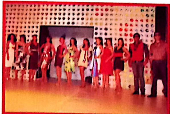
Fashion Show at Indore