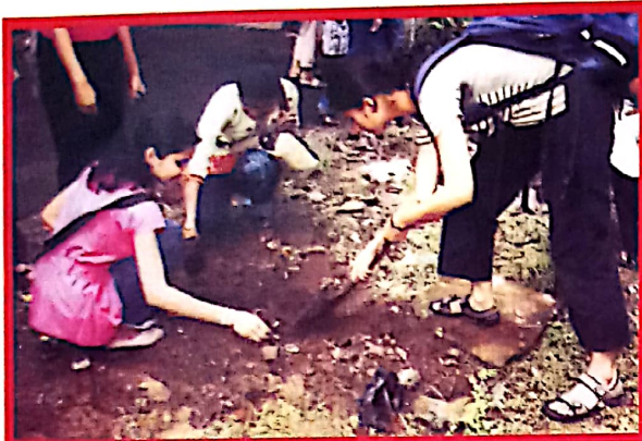
Students at Juhu Campus