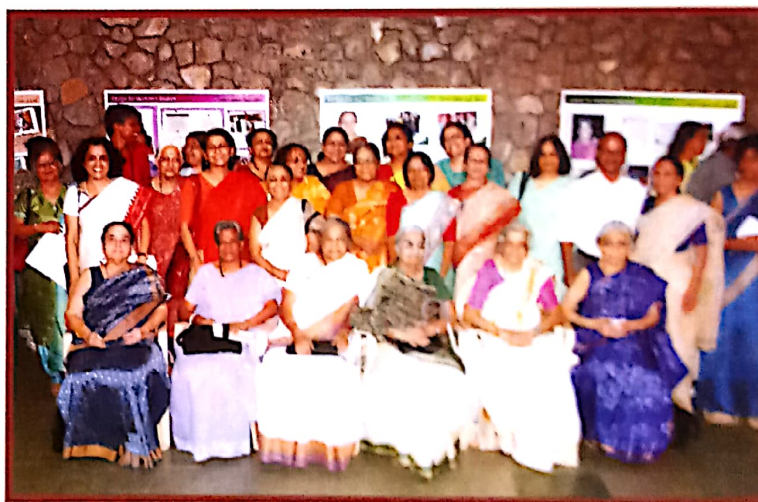
Six outstanding SNDT stalwarts with other members of the SNDT family