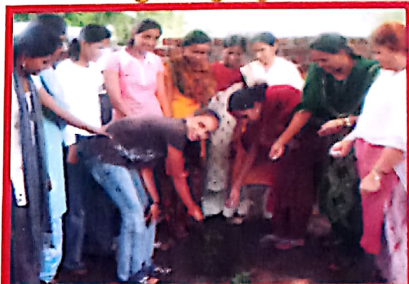
Students at Palghar Campus