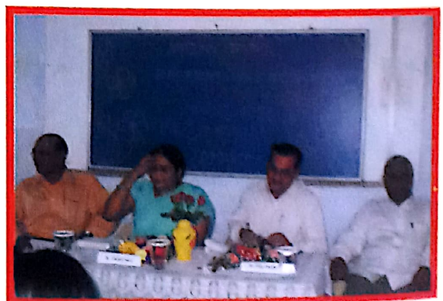
National Seminar by P. G. Dept. of Commerce