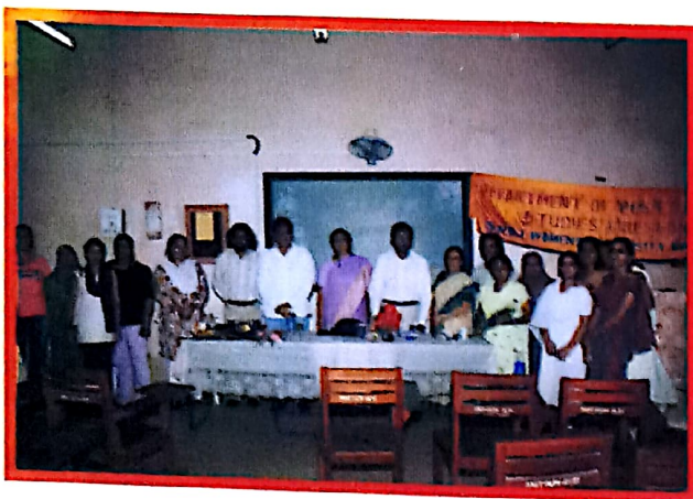
Students at Kavi Sammelan