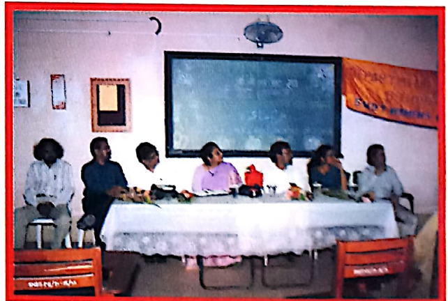
Kavi Sammelan by PGSR