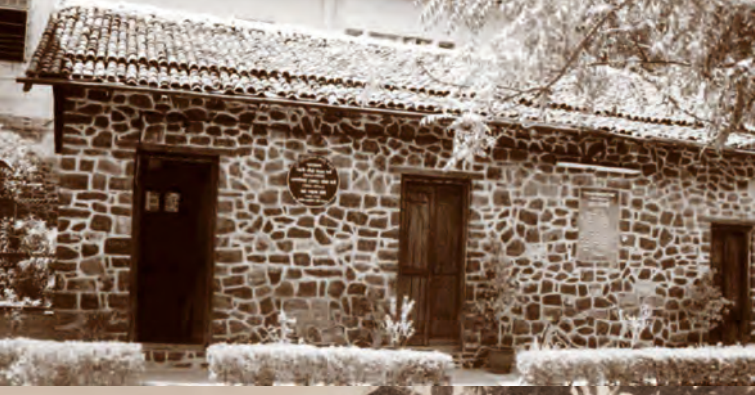
आश्रमाची मूळ झोपडी