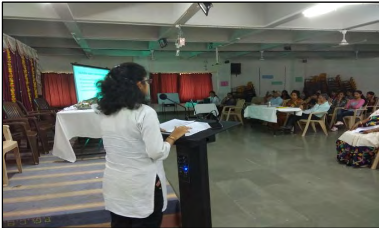
Participation of Students in intercollegiate competitions and seminars.