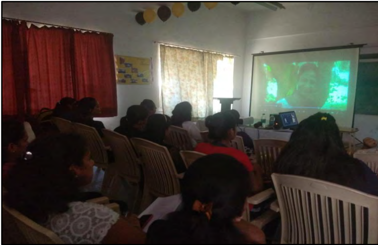
Management Film Festival