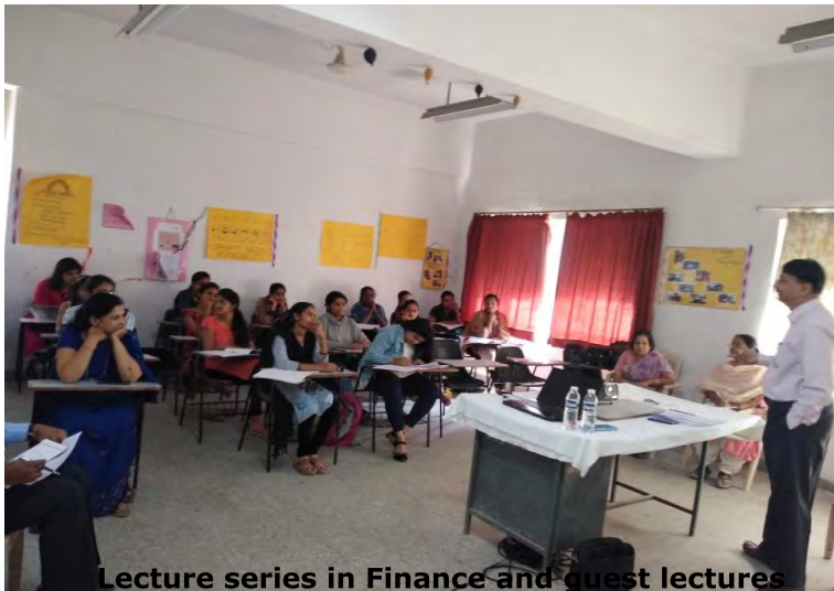
Lecture series in Finance and guest lectures on related areas organised on regular basis.