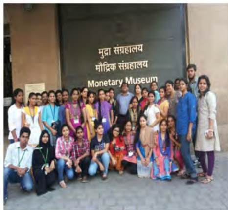
RBI Museum Visit, 2018