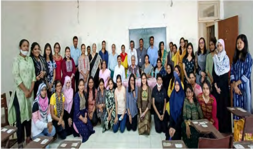
Marathi Bhasha Din organised by History, Economics and Sociology departments