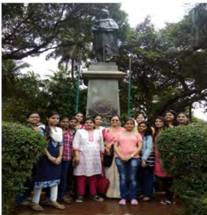
Heritage Walk of Freedom Movement Monuments, 2016