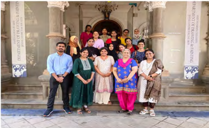
Field Visit to Heritage Building, Kanyashala, Girgaum 2021