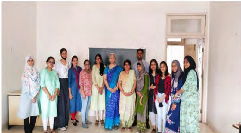
International Women's Day, 8 th March 2022