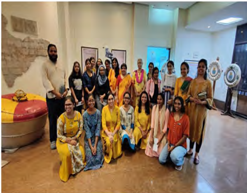
Exhibition at Maritime History Society, 29 th September 2022

The Department of History organises Heritage walk to different places in the city of Mumbai and make the participant faculty and students aware of the rich heritage, history and culture around them. The photographs of such heritage walk has been given in the next pages.