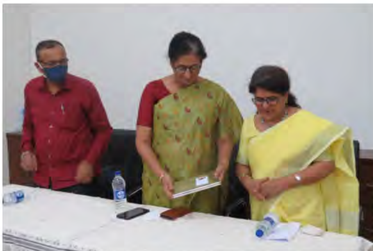
Honorable VC Madam in the inaugural ceremony of the State Level Seminar on Research and Career in History